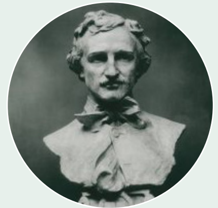
EDGAR ALLAN POE