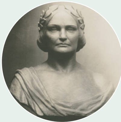
CHARLOTTE SAUNDERS CUSHMAN