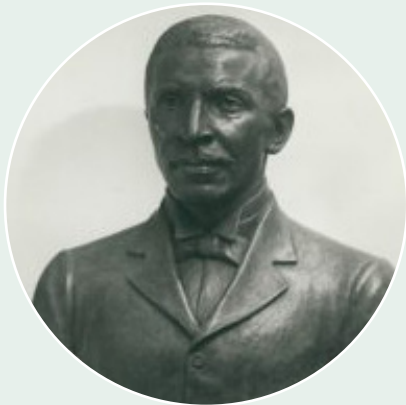
GEORGE WASHINGTON CARVER